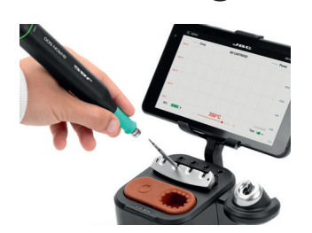
5 Insert cartridge