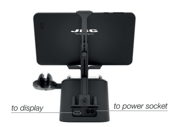
2 Connect cables