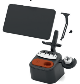
Mount display onto Charging-Base