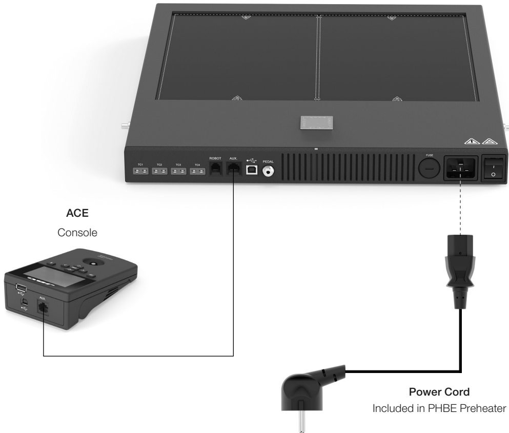
PHBE Preheater Unit