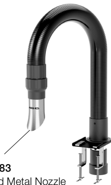
FAE083 Round Metal Nozzle

Flexible Hose ø50 mm ..... 1 unit Ref. FAE010