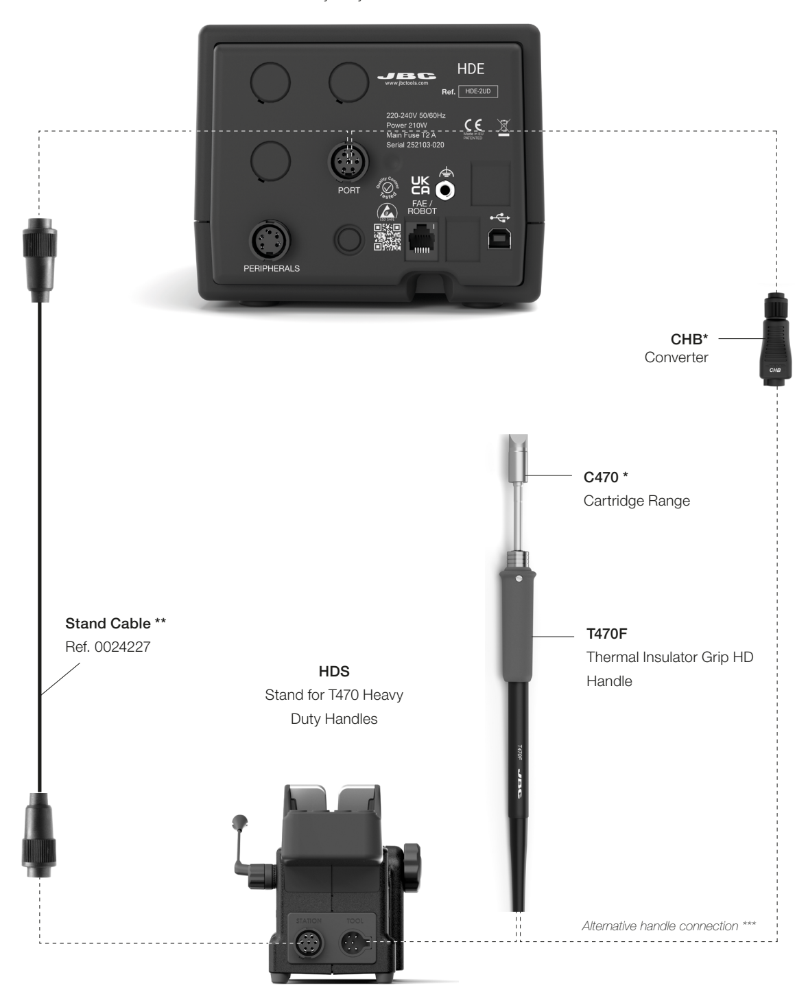
HDE Heavy Duty Control Unit