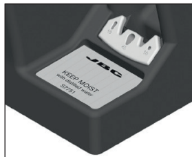
Compact Stations (A version)