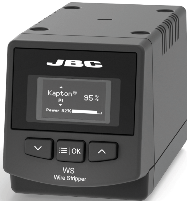
WS High-Temperature Wire Stripper Control Unit