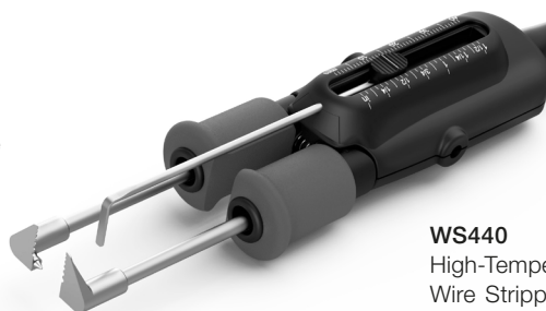
WS440 High-Temperature Wire Stripper Tweezers